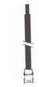
Power Infeed 84DL20AP1 Shown