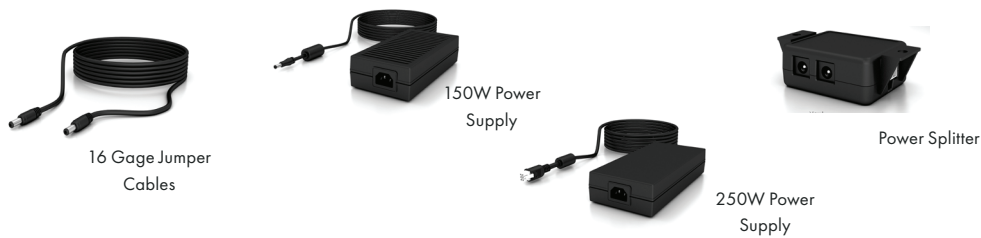
16 Gage Jumper Cables