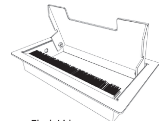
Flush Lid (Open)